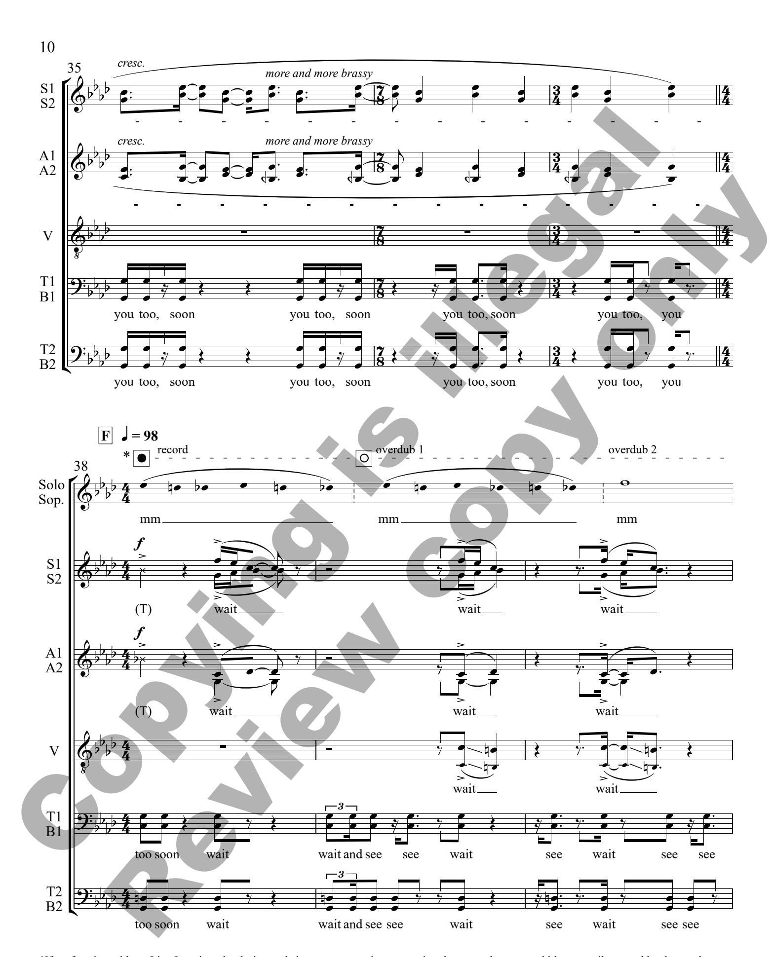
*If performing without Live Looping, the designated singers may continue repeating the notated pattern ad libitum until stopped by the conductor.