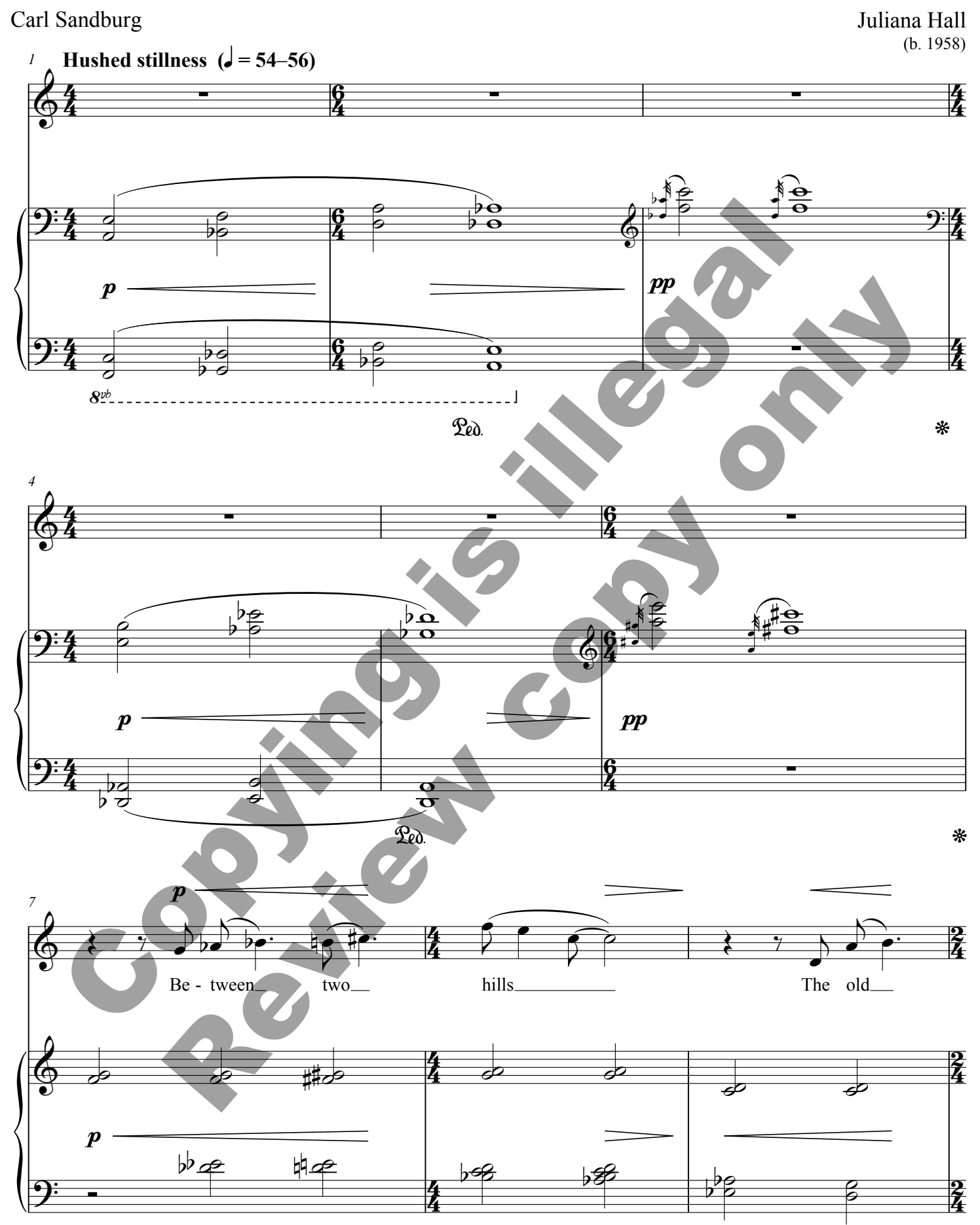
Between Two Hills was first published in Chicago Poems, Copyright © 1916 by Henry Holt and Company, and is in the public domain.

© Copyright 2017 by E. C. Schirmer Music Company, Inc., a division of ECS Publishing Group. www.ecspublishing.com All rights reserved.