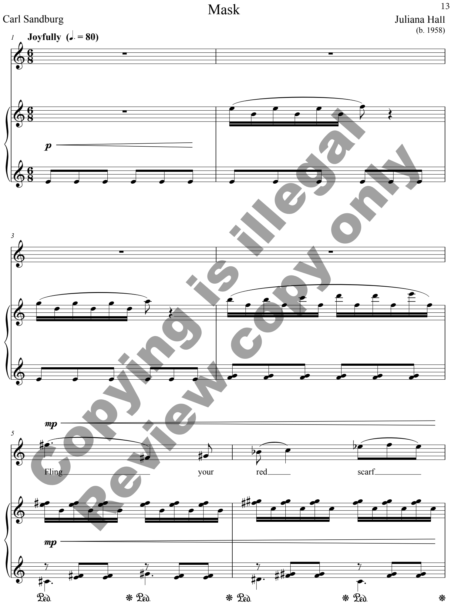
Mask was first published in Chicago Poems, Copyright © 1916 by Henry Holt and Company, and is in the public domain. © Copyright 2017 by E. C. Schirmer Music Company, Inc., a division of ECS Publishing Group. www.ecspublishing.com All rights reserved.