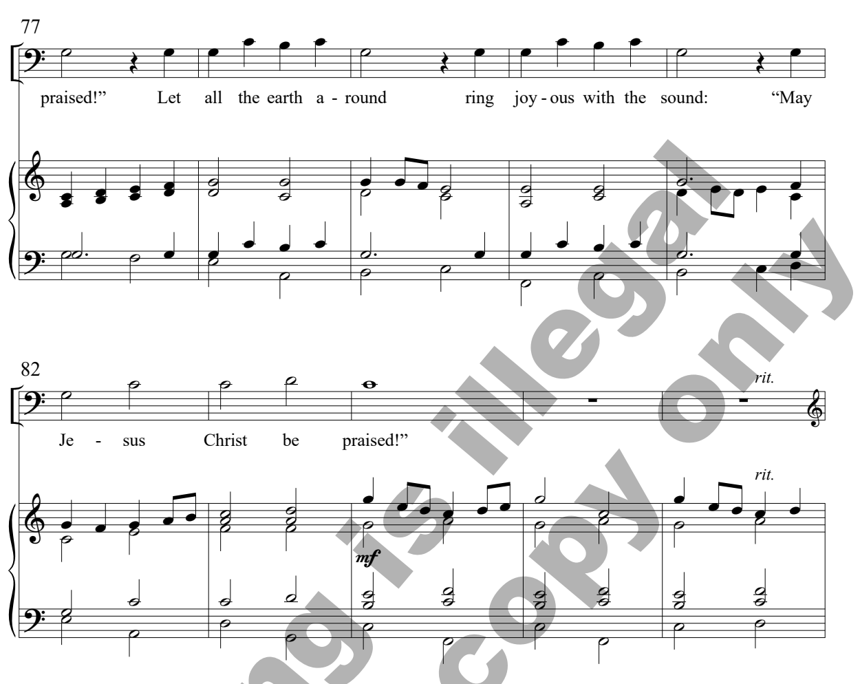
Stanza 5: High Voices (ST), Low Voices (AB), Congregation, and Organ