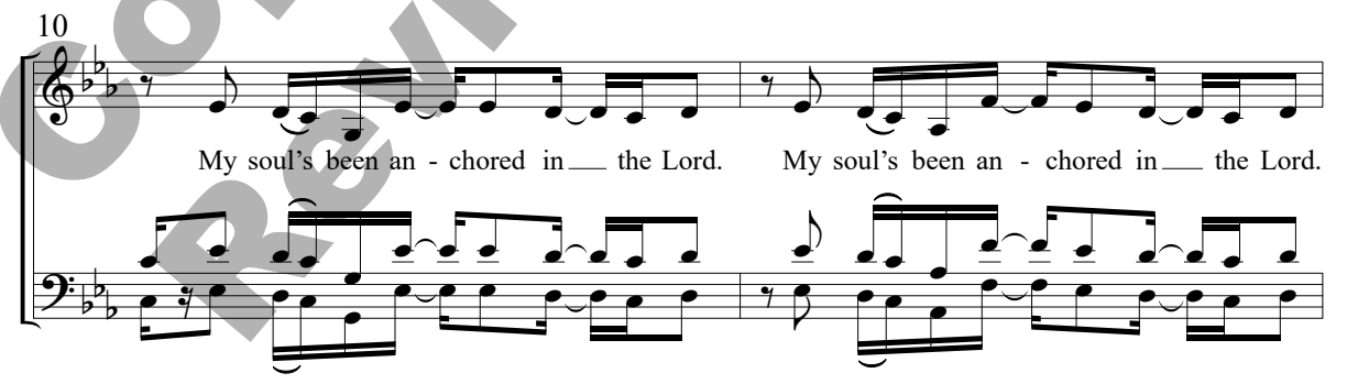
Lord. My soul's been an - chored in ___ the Lord.